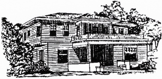
The Douglas-Williams House